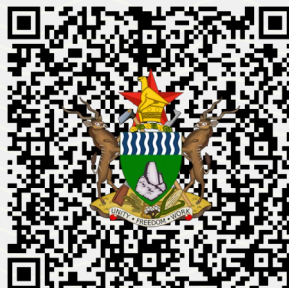
Chief Registrar of Companies

Given under my hand this 24th day of January 2025